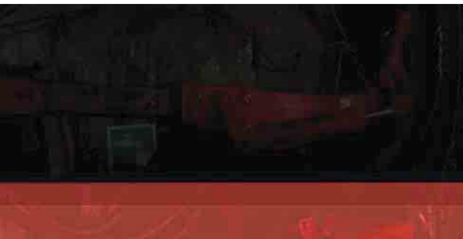
Geographic distribution of outstanding shares (%)