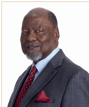
Joaquim Chissano (81) PhD (Honorius Causa)